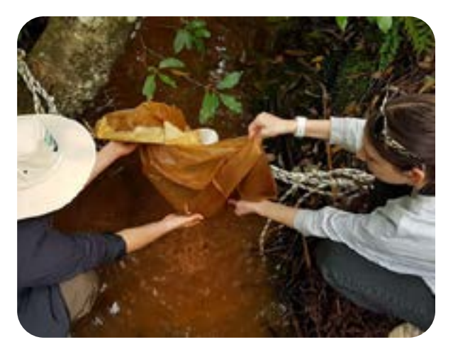
Be A Sport: Let's Stop Rubber Crumb Loss AUSMAP and Ku-ring-gai Council

Synthetic grass and rubber crumb infill are both pollutants of concern with potential health and environmental impacts.