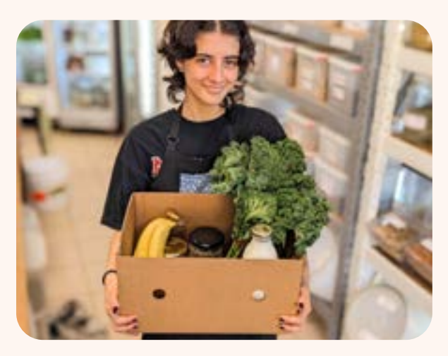
Zero-Waste Click & Collect Manly Food Co-operative

The Manly Food Co-op acknowledges that it can be hard for members to find time to do their bulk food shopping and avoid waste. With their Click & Collect service, members can order via an app and pick up their shopping the next day.