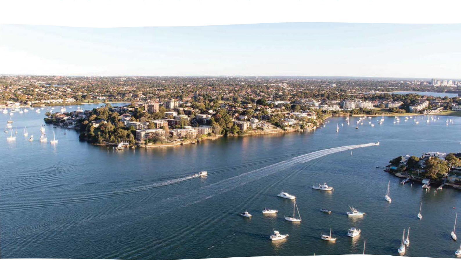
Entries close 31 July 2022