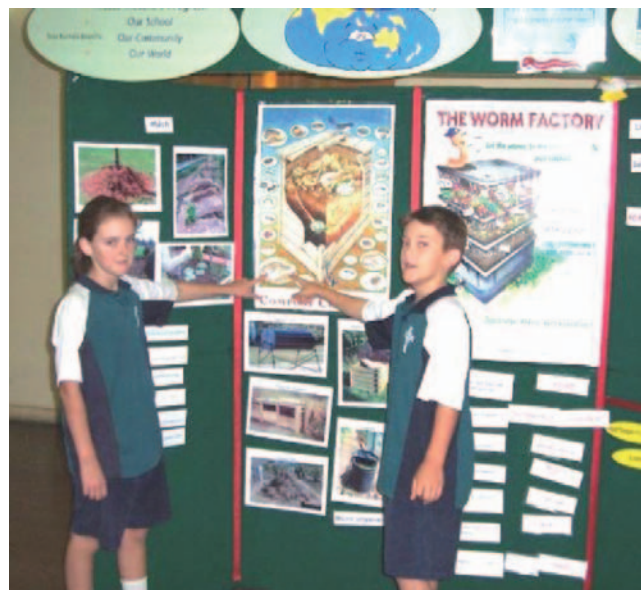
Young Waste Watchers know the benefits of looking after our environment