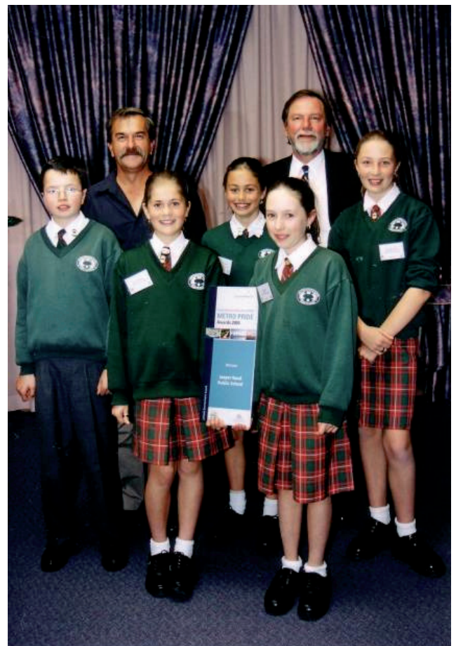
Pupils from Jasper Road Public School receiving the Metro Pride Schools Environment Award