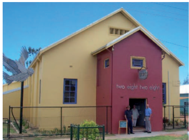
"two eight two eight" – the centerpiece of the award winning Gulargambone Community