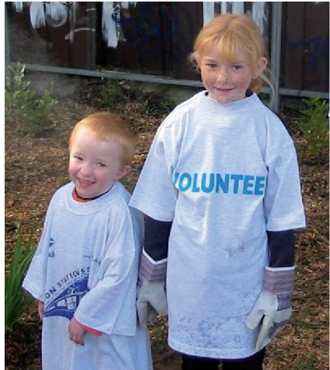
Young volunteers helping out with a local Action Stations project